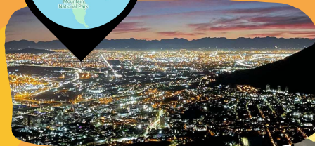
Embarking on a hike up Lion's Head Mountain at 4 AM, Experiencing a stunning aerial view of Cape Town.