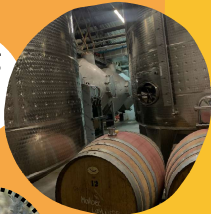
Wine production at Stellenbosch wine estates