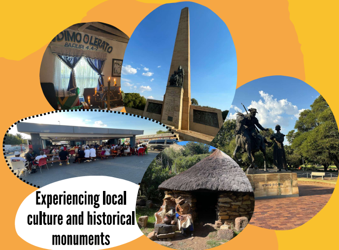
Experiencing local culture and historical monuments