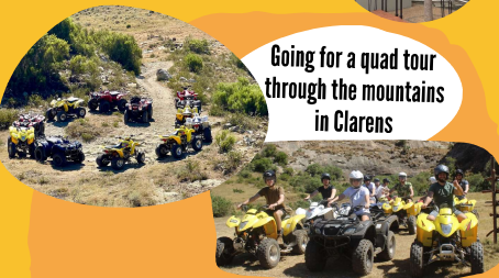
Going for a quad tour through the mountains in Clarens