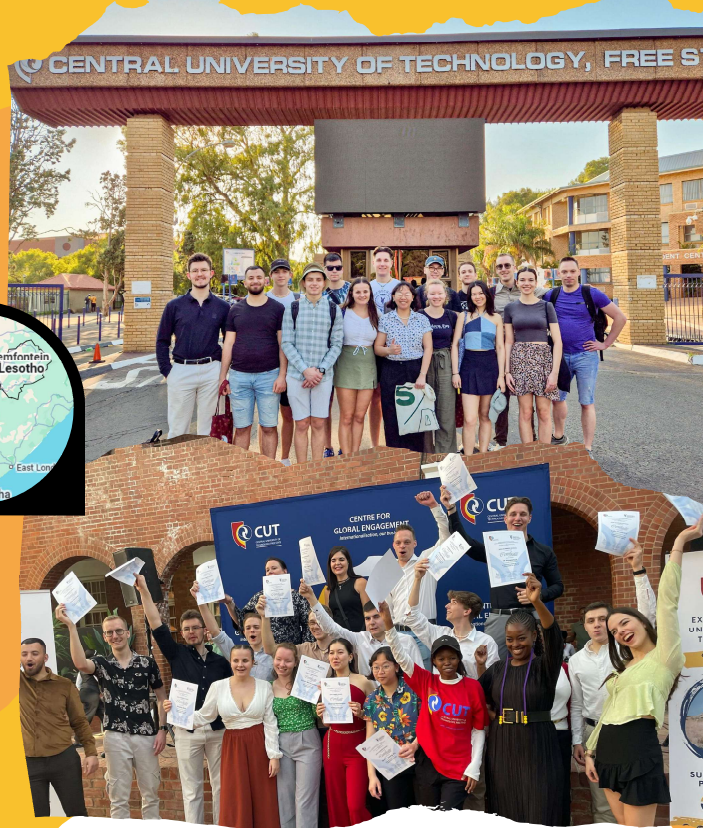
At our partner university CUT in Bloemfontein. Lectures included interactive Q&A sessions and group discussions, fostering active student participation. The ending ceremony featured speeches, certificates, and a traditional drum session.