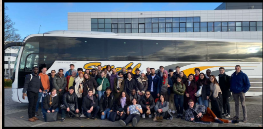
START OF EXCURSION